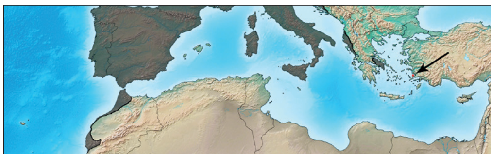
Fig. 3. Known distribution of Cacyreus marshalli in Europe and North Africa (shaded area; modified from Tshikolovets 2011), and the approximate position of the observation in Turkey (red circle, arrow).